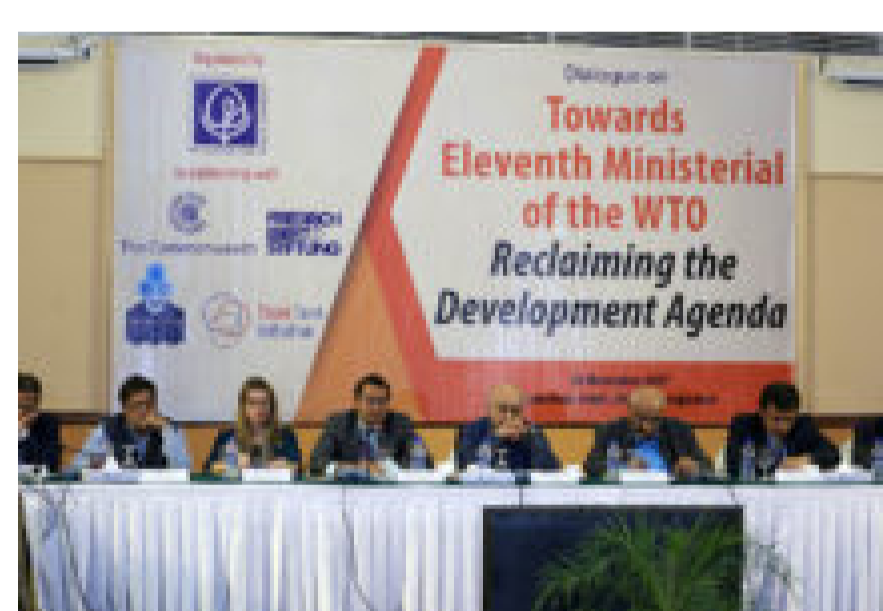
Bangladesh to Keep up Dual Approach to WTO