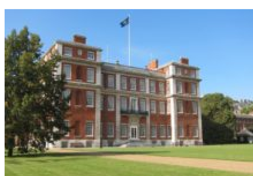
Agenda 2030 and the SDGs: what prospects for LDCs graduation trajectory?