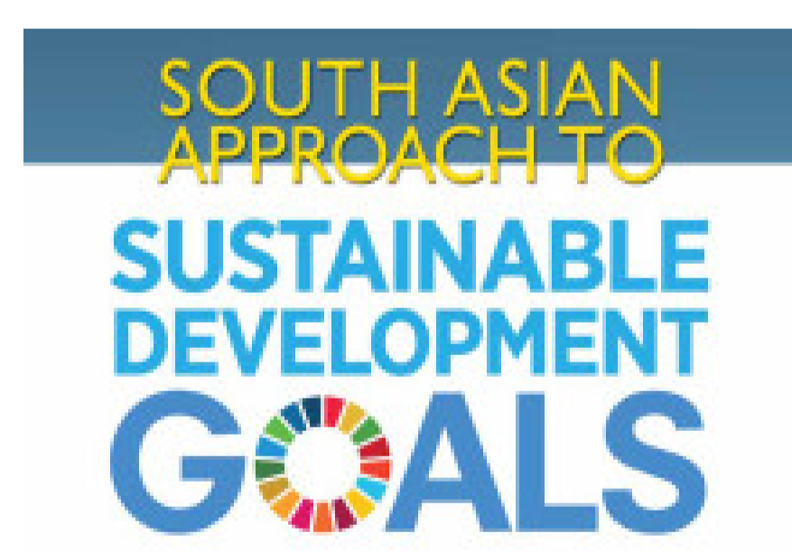
South Asian Approach to Sustainable Development Goals